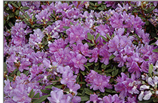
Purple Gem Rhododendron flowers