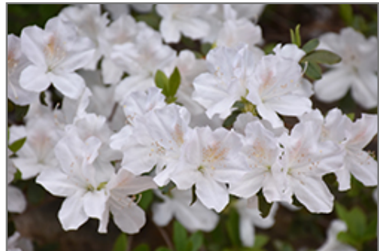
Delaware Valley White Azalea flowers