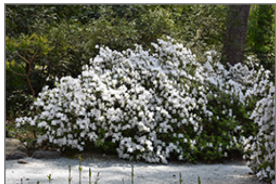
Delaware Valley White Azalea in bloom