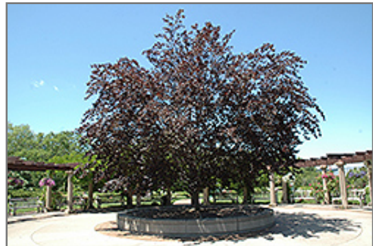
Purple Beech