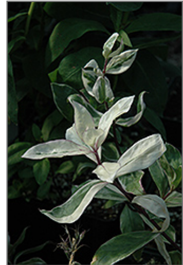
Montrose Tricolor Phlox foliage