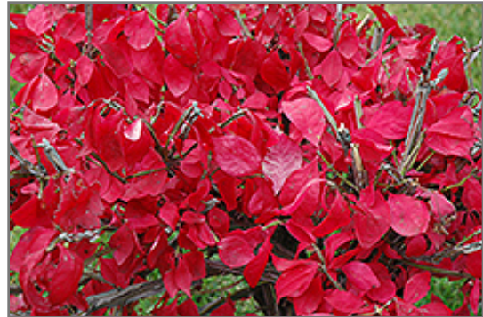
Compact Winged Burning Bush in fall