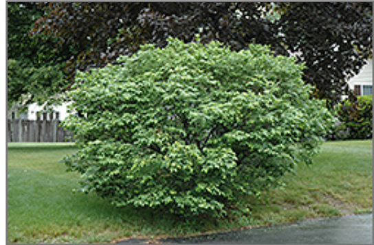
Compact Winged Burning Bush

Compact Winged Burning Bush will grow to be about 7 feet tall at maturity, with a spread of 7 feet. It tends to fill out right to the ground and therefore doesn't necessarily require facer plants in front, and is suitable for planting under power lines. It grows at a slow rate, and under ideal conditions can be expected to live for 50 years or more.