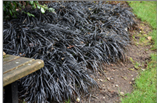
Black Mondo Grass