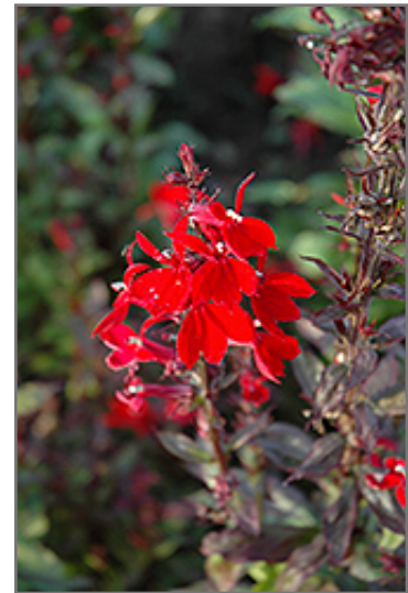
Queen Victoria Lobelia flowers