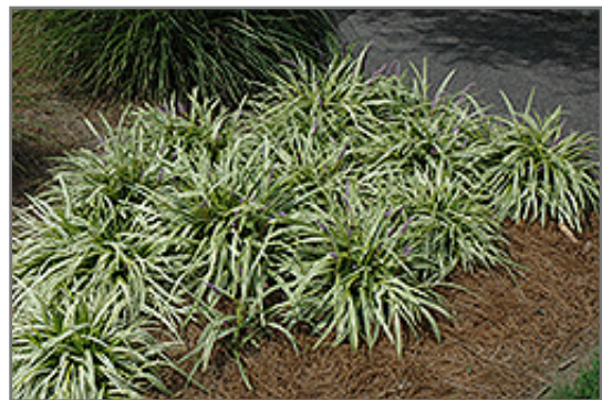
Variegata Lily Turf in bloom