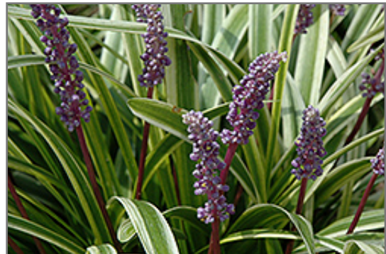
Variegata Lily Turf flowers

Variegata Lily Turf is recommended for the following landscape applications;