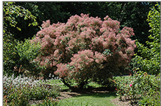
Grace Smokebush in bloom

Grace Smokebush is recommended for the following landscape applications;