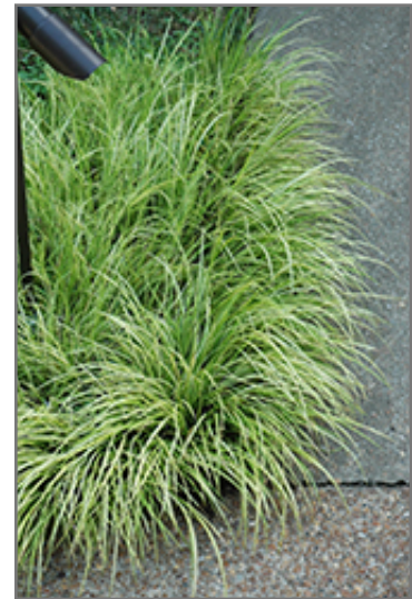
Grassy-Leaved Sweet Flag

Grassy-Leaved Sweet Flag will grow to be about 12 inches tall at maturity, with a spread of 12 inches. Its foliage tends to remain dense right to the ground, not requiring facer plants in front. It grows at a medium rate, and under ideal conditions can be expected to live for approximately 10 years. As an herbaceous perennial, this plant will usually die back to the crown each winter, and will regrow from the base each spring. Be careful not to disturb the crown in late winter when it may not be readily seen!