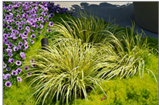
Grassy-Leaved Sweet Flag

Grassy-Leaved Sweet Flag is recommended for the following landscape applications;