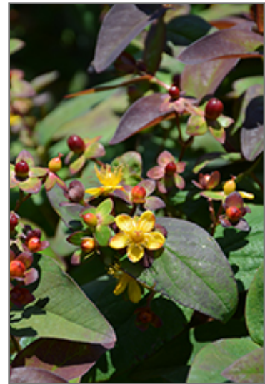
Albury Purple St. John's Wort flowers