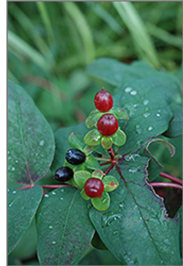
Albury Purple St. John's Wort fruit

Albury Purple St. John's Wort makes a fine choice for the outdoor landscape, but it is also well-suited for use in outdoor pots and containers. With its upright habit of growth, it is best suited for use as a 'thriller' in the 'spiller-thriller-filler' container combination; plant it near the center of the pot, surrounded by smaller plants and those that spill over the edges. It is even sizeable enough that it can be grown alone in a suitable container. Note that when grown in a container, it may not perform exactly as indicated on the tag - this is to be expected. Also note that when growing plants in outdoor containers and baskets, they may require more frequent waterings than they would in the yard or garden.