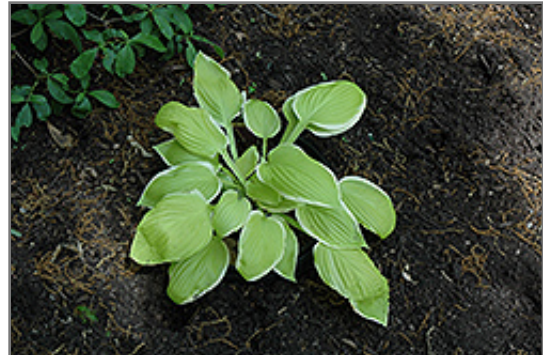
St. Elmo's Fire Hosta