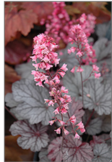
Milan Coral Bells flowers

Milan Coral Bells is recommended for the following landscape applications;