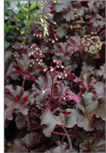
Melting Fire Coral Bells flowers

Melting Fire Coral Bells is a fine choice for the garden, but it is also a good selection for planting in outdoor pots and containers. It is often used as a 'filler' in the 'spiller-thriller-filler' container combination, providing a mass of flowers and foliage against which the larger thriller plants stand out. Note that when growing plants in outdoor containers and baskets, they may require more frequent waterings than they would in the yard or garden.