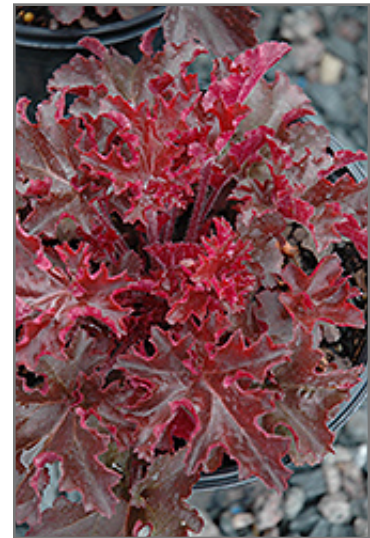
Melting Fire Coral Bells foliage