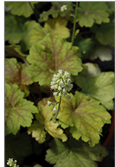
Electra Coral Bells flowers