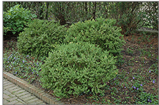
Wintergreen Boxwood