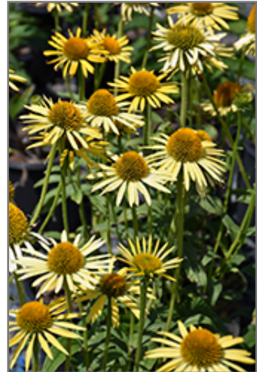
Maui Sunshine Coneflower flowers