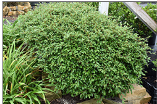
Scarlet Leader Willowleaf Cotoneaster