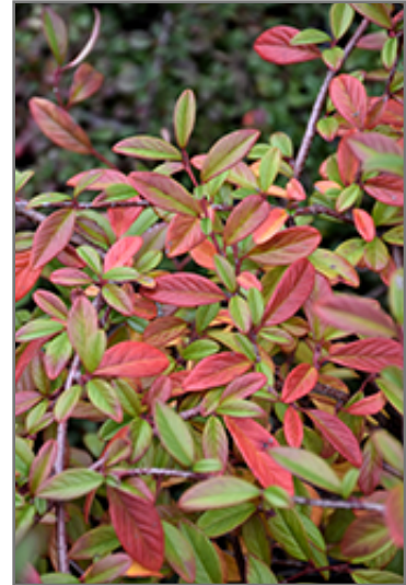
Scarlet Leader Willowleaf Cotoneaster in fall

This shrub does best in full sun to partial shade. It is very adaptable to both dry and moist growing conditions, but will not tolerate any standing water. It is not particular as to soil type or pH, and is able to handle environmental salt. It is highly tolerant of urban pollution and will even thrive in inner city environments. This is a selected variety of a species not originally from North America.