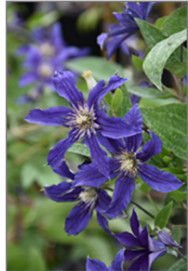
Sapphire Indigo Clematis flowers