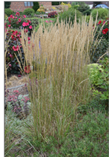
El Dorado Feather Reed Grass