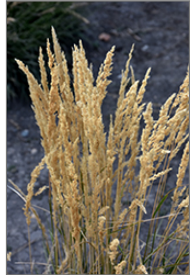
El Dorado Feather Reed Grass fruit

El Dorado Feather Reed Grass is a fine choice for the garden, but it is also a good selection for planting in outdoor pots and containers. Because of its height, it is often used as a 'thriller' in the 'spiller-thriller-filler' container combination; plant it near the center of the pot, surrounded by smaller plants and those that spill over the edges. It is even sizeable enough that it can be grown alone in a suitable container. Note that when growing plants in outdoor containers and baskets, they may require more frequent waterings than they would in the yard or garden.