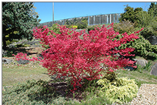
Shindeshojo Japanese Maple in spring

This tree does best in full sun to partial shade. You may want to keep it away from hot, dry locations that receive direct afternoon sun or which get reflected sunlight, such as against the south side of a white wall. It prefers to grow in average to moist conditions, and shouldn't be allowed to dry out. It is not particular as to soil pH, but grows best in rich soils. It is somewhat tolerant of urban pollution, and will benefit from being planted in a relatively sheltered location. Consider applying a thick mulch around the root zone in winter to protect it in exposed locations or colder microclimates. This is a selected variety of a species not originally from North America.