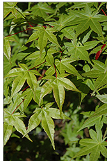
Shindeshojo Japanese Maple foliage