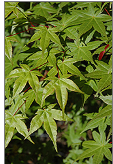
Shindeshojo Japanese Maple foliage