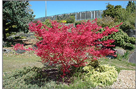
Shindeshojo Japanese Maple in spring

This tree does best in full sun to partial shade. You may want to keep it away from hot, dry locations that receive direct afternoon sun or which get reflected sunlight, such as against the south side of a white wall. It prefers to grow in average to moist conditions, and shouldn't be allowed to dry out. It is not particular as to soil pH, but grows best in rich soils. It is somewhat tolerant of urban pollution, and will benefit from being planted in a relatively sheltered location. Consider applying a thick mulch around the root zone in winter to protect it in exposed locations or colder microclimates. This is a selected variety of a species not originally from North America.