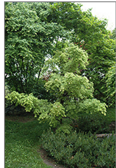
Higasa Yama Japanese Maple