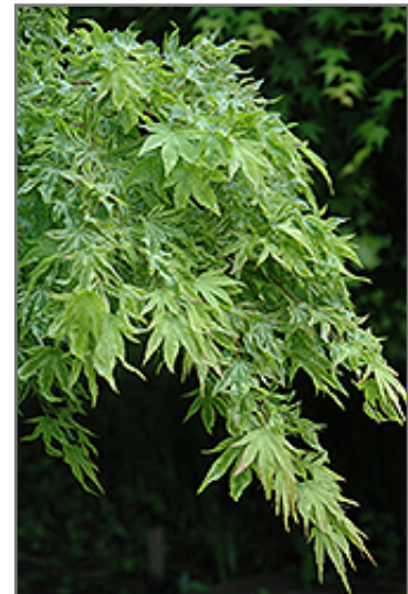
Higasa Yama Japanese Maple foliage