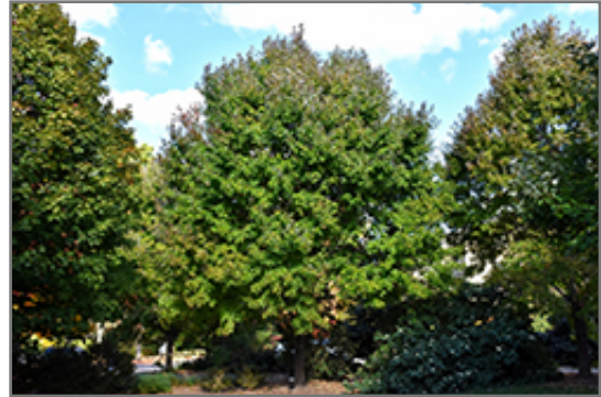
Autumn Flame Red Maple

This tree should only be grown in full sunlight. It is quite adaptable, preferring to grow in average to wet conditions, and will even tolerate some standing water. It is not particular as to soil type, but has a definite preference for acidic soils, and is subject to chlorosis (yellowing) of the foliage in alkaline soils. It is somewhat tolerant of urban pollution. This is a selection of a native North American species.