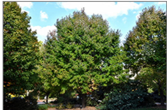
Autumn Flame Red Maple

This tree should only be grown in full sunlight. It is quite adaptable, preferring to grow in average to wet conditions, and will even tolerate some standing water. It is not particular as to soil type, but has a definite preference for acidic soils, and is subject to chlorosis (yellowing) of the foliage in alkaline soils. It is somewhat tolerant of urban pollution. This is a selection of a native North American species.