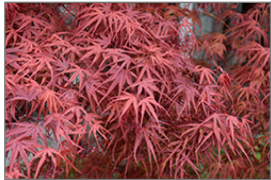
Beni Otake Japanese Maple foliage