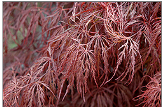
Crimson Queen Japanese Maple foliage

Crimson Queen Japanese Maple is recommended for the following landscape applications;