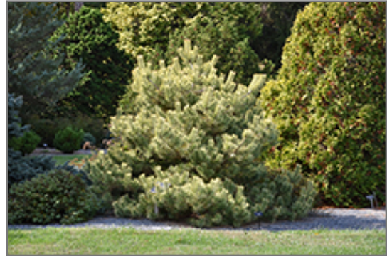
Gold Coin Scotch Pine

Gold Coin Scotch Pine will grow to be about 20 feet tall at maturity, with a spread of 15 feet. It has a low canopy with a typical clearance of 1 foot from the ground, and is suitable for planting under power lines. It grows at a medium rate, and under ideal conditions can be expected to live for 60 years or more.