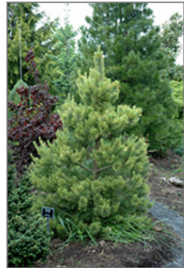
Gold Coin Scotch Pine

This is a relatively low maintenance tree. When pruning is necessary, it is recommended to only trim back the new growth of the current season, other than to remove any dieback. Deer don't particularly care for this plant and will usually leave it alone in favor of tastier treats. It has no significant negative characteristics.