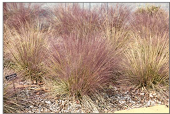
Hairawn Muhly in fall