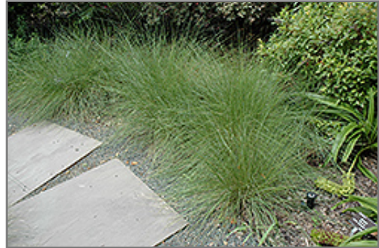
Hairawn Muhly

Hairawn Muhly is recommended for the following landscape applications;