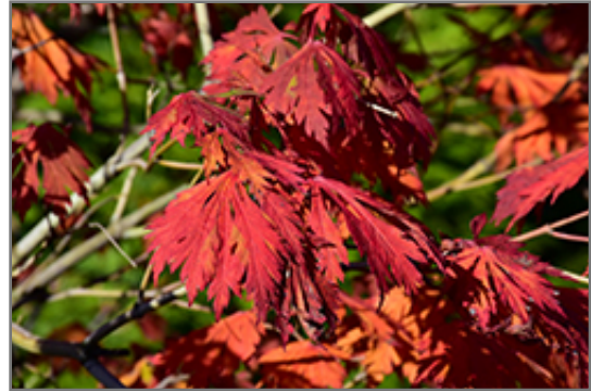
Cutleaf Fullmoon Maple in fall

This tree should only be grown in full sunlight, although you may want to keep it away from hot, dry locations that receive direct afternoon sun or which get reflected sunlight, such as against the south side of a white wall. It prefers to grow in average to moist conditions, and shouldn't be allowed to dry out. It is not particular as to soil type or pH. It is quite intolerant of urban pollution, therefore inner city or urban streetside plantings are best avoided, and will benefit from being planted in a relatively sheltered location. Consider applying a thick mulch around the root zone in winter to protect it in exposed locations or colder microclimates. This is a selected variety of a species not originally from North America.