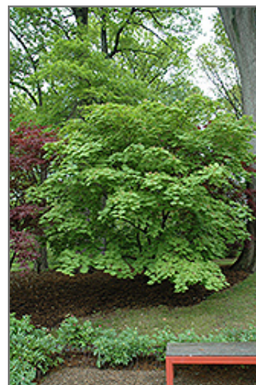
Cutleaf Fullmoon Maple