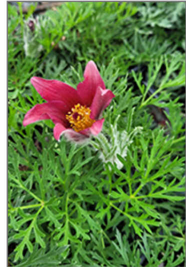
Red Pasqueflower flowers