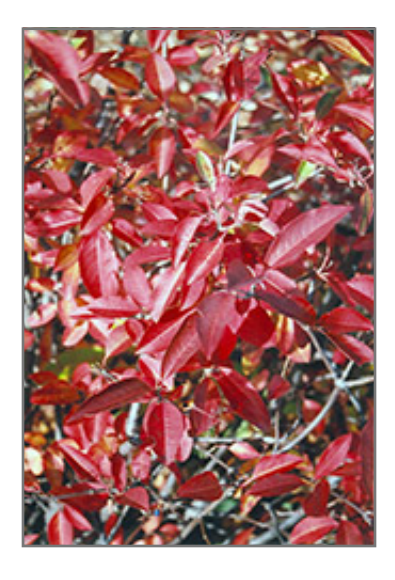
Witherod Viburnum in fall

This shrub does best in full sun to partial shade. It prefers to grow in average to moist conditions, and shouldn't be allowed to dry out. It is not particular as to soil type or pH. It is somewhat tolerant of urban pollution. This species is native to parts of North America.