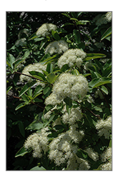
Witherod Viburnum flowers