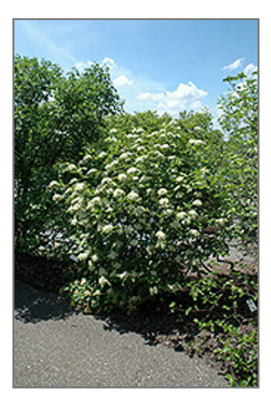
Witherod Viburnum in bloom