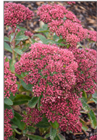
Munstead Dark Red Stonecrop flowers

Munstead Dark Red Stonecrop is recommended for the following landscape applications;