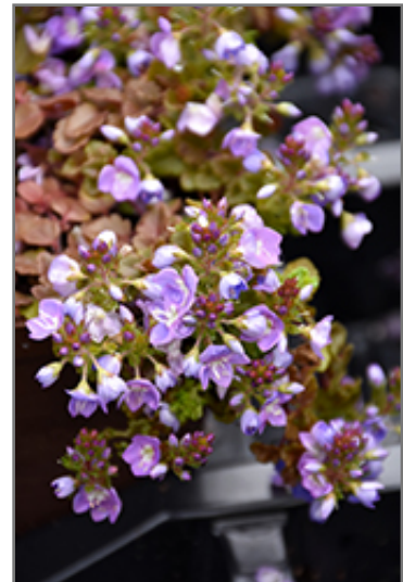
Crystal River Speedwell flowers