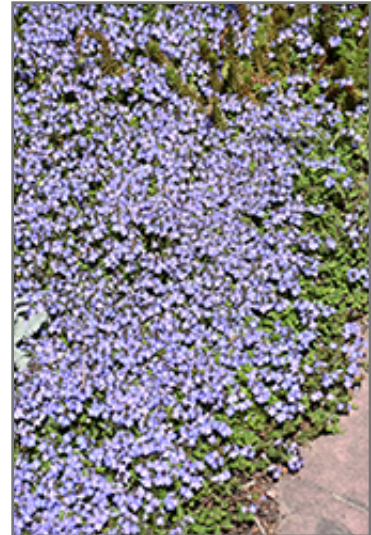
Crystal River Speedwell in bloom