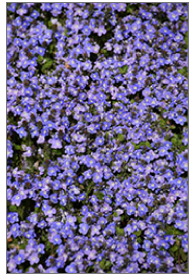
Crystal River Speedwell flowers