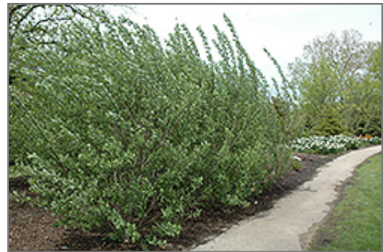
French Pussy Willow