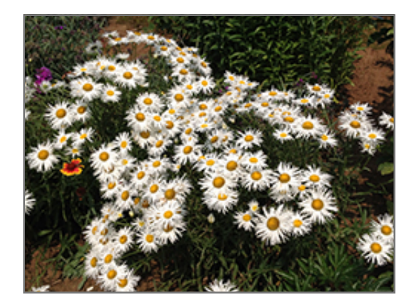
Crazy Daisy Shasta Daisy in bloom