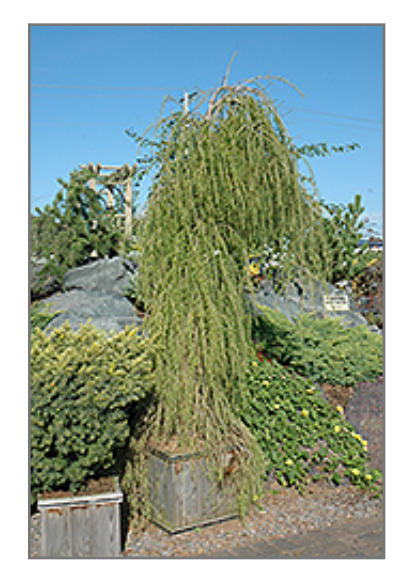
Puli Weeping Larch

This shrub does best in full sun to partial shade. It is quite adaptable, prefering to grow in average to wet conditions, and will even tolerate some standing water. It is not particular as to soil type or pH. It is somewhat tolerant of urban pollution. This is a selected variety of a species not originally from North America.