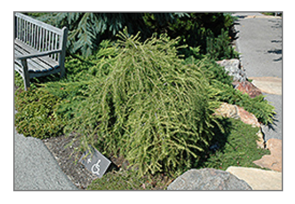
Puli Weeping Larch

Puli Weeping Larch is recommended for the following landscape applications;