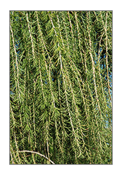
Puli Weeping Larch foliage