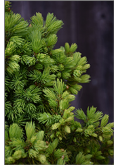
Rainbow's End Spruce foliage

This shrub should only be grown in full sunlight. It prefers to grow in average to moist conditions, and shouldn't be allowed to dry out. It is not particular as to soil type or pH. It is somewhat tolerant of urban pollution, and will benefit from being planted in a relatively sheltered location. This is a selection of a native North American species.