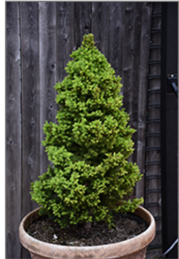
Rainbow's End Spruce