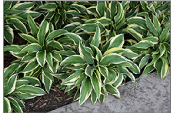
Wolverine Hosta