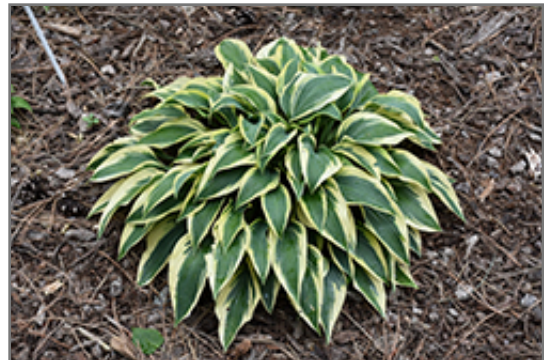
Wolverine Hosta

Wolverine Hosta will grow to be about 12 inches tall at maturity extending to 18 inches tall with the flowers, with a spread of 3 feet. When grown in masses or used as a bedding plant, individual plants should be spaced approximately 30 inches apart. Its foliage tends to remain dense right to the ground, not requiring facer plants in front. It grows at a medium rate, and under ideal conditions can be expected to live for approximately 10 years. As an herbaceous perennial, this plant will usually die back to the crown each winter, and will regrow from the base each spring. Be careful not to disturb the crown in late winter when it may not be readily seen!