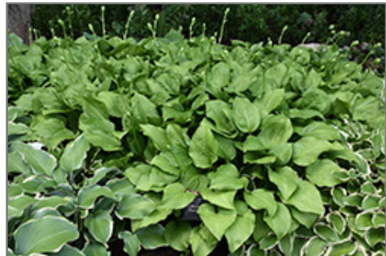
Royal Standard Hosta

Royal Standard Hosta is recommended for the following landscape applications;