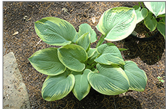
Robert Frost Hosta