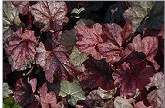
Beaujolais Hairy Alumroot foliage