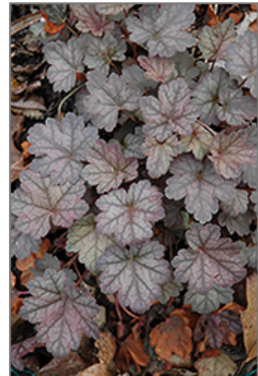
Dolce Mocha Mint Coral Bells foliage

Dolce Mocha Mint Coral Bells is recommended for the following landscape applications;