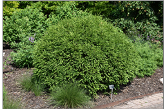
Green Gem Boxwood