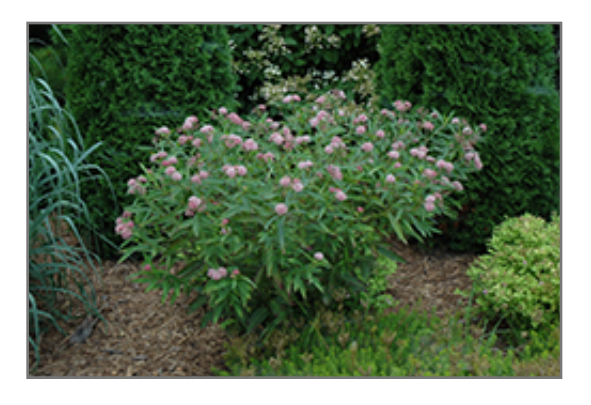
Cinderella Milkweed in bloom

Cinderella Milkweed is an herbaceous perennial with an upright spreading habit of growth. Its medium texture blends into the garden, but can always be balanced by a couple of finer or coarser plants for an effective composition.