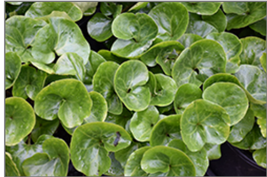
European Wild Ginger foliage