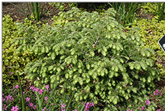
Moon Frost Hemlock

Moon Frost Hemlock is recommended for the following landscape applications;