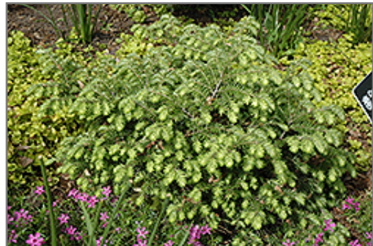
Moon Frost Hemlock

Moon Frost Hemlock is recommended for the following landscape applications;