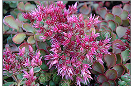
Fulda Glow Stonecrop flowers