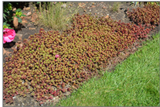
Fulda Glow Stonecrop