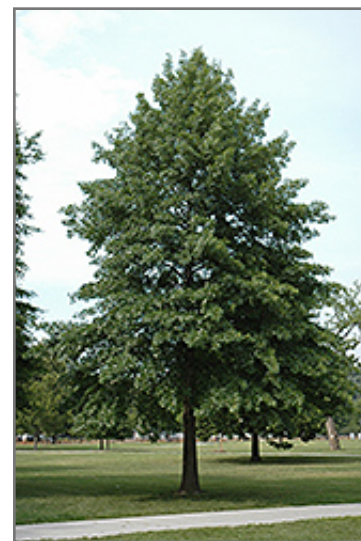
Pin Oak