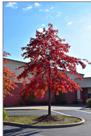
Pin Oak in fall