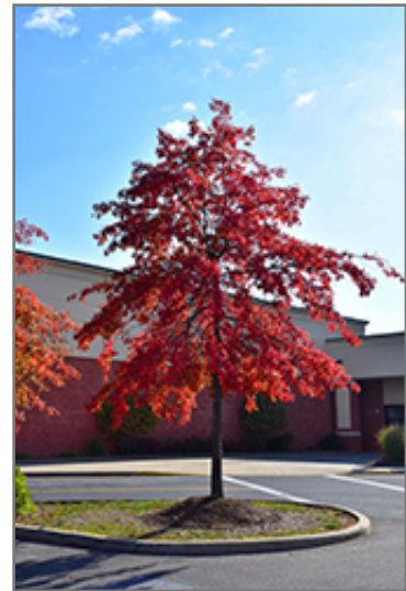
Pin Oak in fall