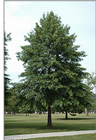
Pin Oak