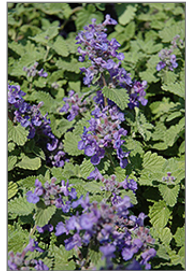
Little Titch Catmint flowers