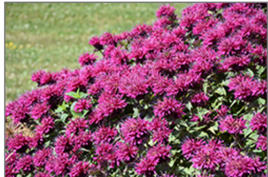
Grand Marshall Beebalm flowers

Grand Marshall Beebalm is recommended for the following landscape applications;