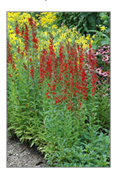
Cardinal Flower in bloom