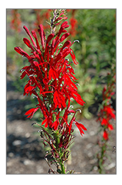
Cardinal Flower flowers